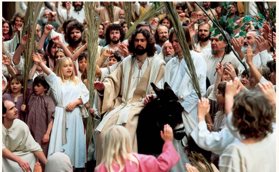
Jesus' triumphant entry into Jerusalem is one of the highlights of the Passion Play.